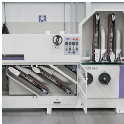
__ 2 upper + 2 lower abrasive belt stations