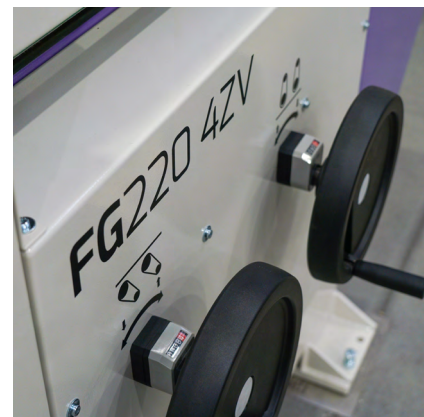
__ independent thickness regulation for upper and lower heads