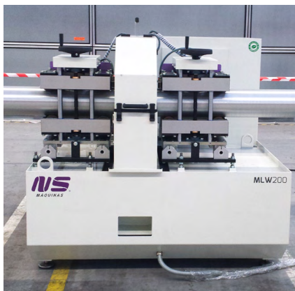
optimized for large diameters and long tubes with minimal vibration