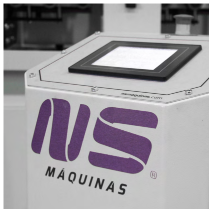
touchscreen on mobile, independent unit (optional)