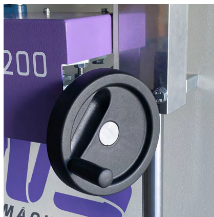
__ stainless-steel table adjustable by handwheel