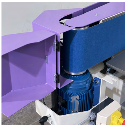
__ vertical and horizontal grinding head positions