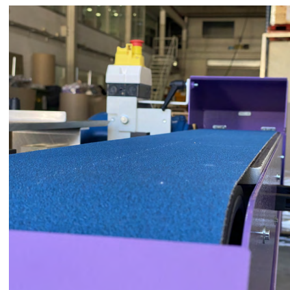
__ LHV200 with horizontal table position