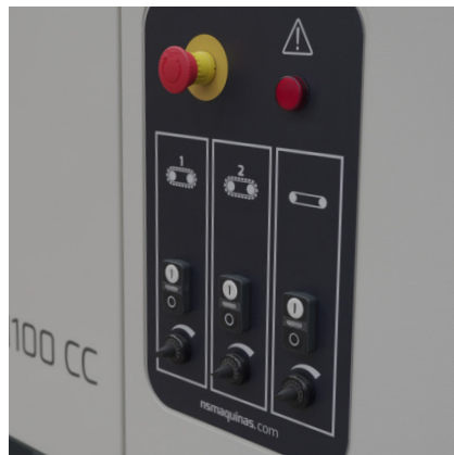
__ simple machine adjustments