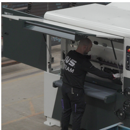
__ fast consumable change